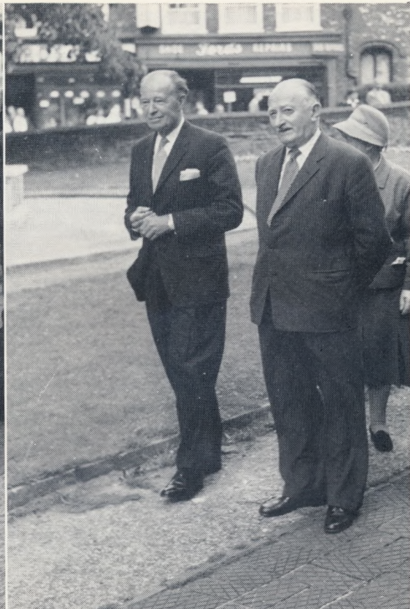
THE HEADS OF THE PROCESSIONS OF GOVERNORS AND CIVIC DIGNITARIES