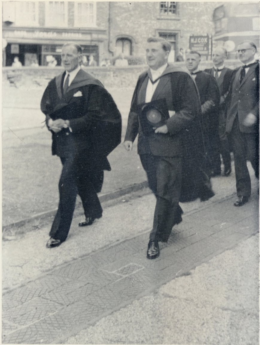
THE HEADMASTER AND STAFF PROCEEDING TO THE COMMEMORATION SERVICE