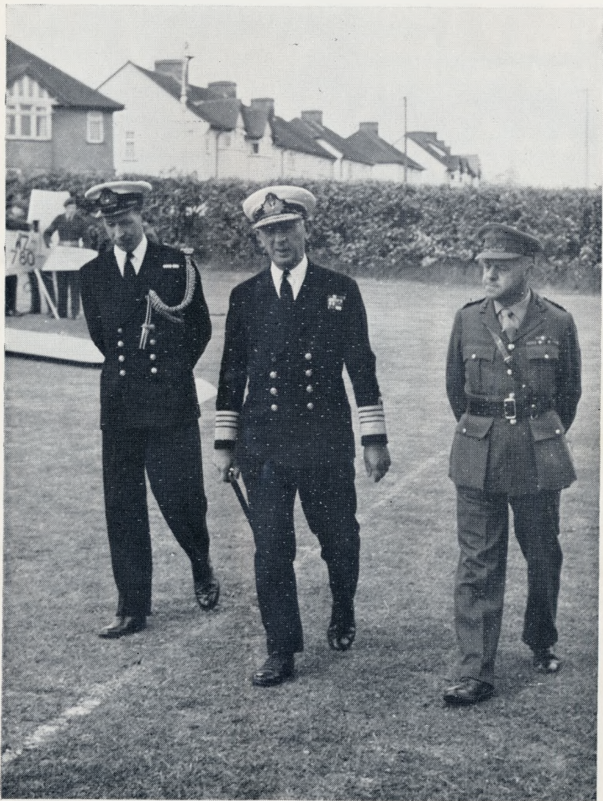
ON HIS TOUR OF INSPECTION